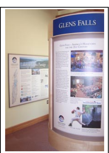
Lakes to Locks Passage and First Wilderness Corridor information and community signs at Lake George Village Visitor Center.