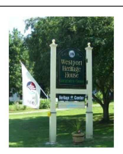
Lakes to Locks Passage Heritage Centers have begun to open along the corridor. Prominently located on the byway, these facilities are designed to be one of the first physical stops people will make when entering the community, and when linked together, they provide connectivity of the byway corridor.

Heritage Center Development Lakes to Locks Passage has developed an authentic "place-based" tourism program that delivers a meaningful experience to the byway traveler by the people who live here. Through a National Scenic Byways Program grant we have been working to develop Heritage Center exhibits