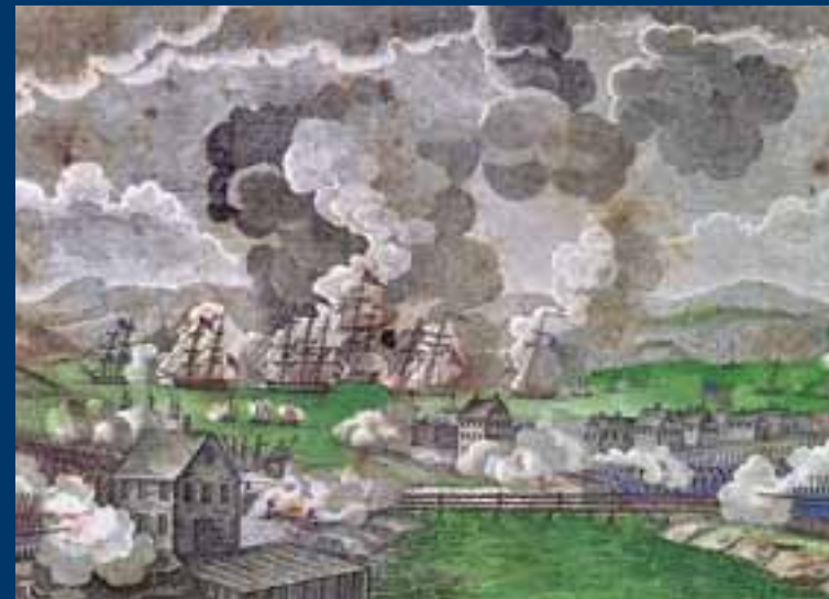
Upper left: USS Niagara breaks through the British line at the Battle of Lake Erie, September 10, 1813, painting by Peter Rindlisbacher. Upper right: Fort Niagara, 1813. Lower left: The British fleet on Lake Ontario landing troops to capture Oswego, May 6, 1814. Bottom right: "Battle of Plattsburg," a hand-colored engraving published shortly after the September 11, 1814, battle.