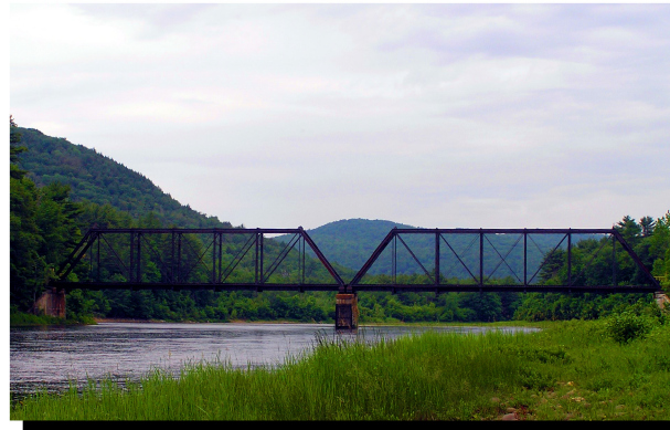
Bridge to Warrensburg, still spanning the river.

Select the appropriate membership category and send in the attached application form with designated payment today. You will receive a membership card and emailed notification of upcoming meetings and other issues pertinent to TSA.. The membership year runs from July 1 - June 30; a member paying dues April 1 or later will be considered to have membership paid through June 30 of the following year.