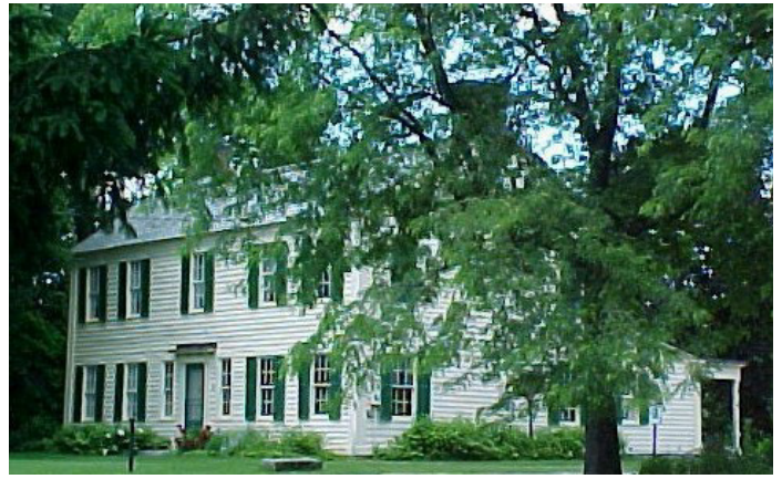
Old Fort House Museum, Fort Edward, NY

On July 4, 1827, New York State emancipated all slaves born after 1799 as a plan for gradual emancipation of the slaves in New York State. A network of secret routes and safe houses, known as the Underground Railroad, drew freedom-seekers through shaded, and often treacherous, terrain on their journey to liberation. Because of the limitations of a culture deemed a “secret,” many of the destinations listed in this itinerary have come from folklore, local legend, and oral histories.